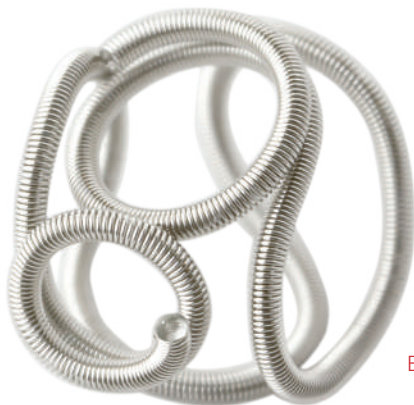
BARRICADE COMPLEX FINISHING COIL